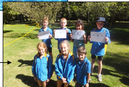
The Hurunui Triathlon Team after their big event